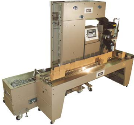
System Shown: Delta Model LSW16 with DF16 Low Level Loader and 2F4 Carton Conveyor