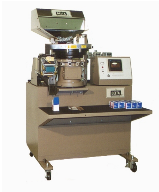
Delta Model LCM22 with 2 Cubic Foot Vibratory Hopper and Worktable