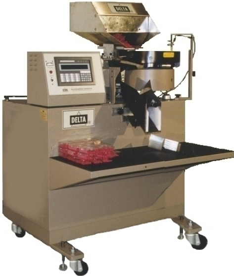
System Shown: Delta Model LW16 with Vibratory Hopper and Workshelf